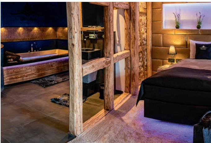
SPA VILLA Beauty & Wellness Resort, Wingerode, Germany