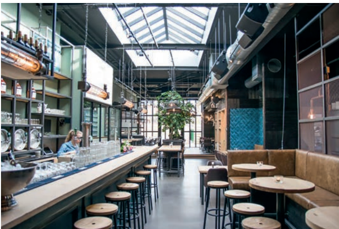
Restaurant ROAST, Leeuwarden, the Netherlands

Depending on the range of application, room size and room situation, it is important to thoroughly plan a tailor-made solution, i.e. each project has got a special main focus and specific requirements. Together with planning experts from MONACOR, you will be able to create the perfect solution for your intended location.