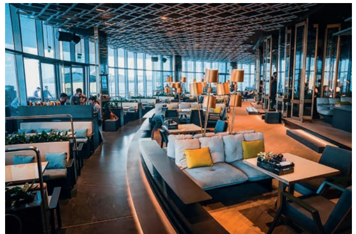
Restaurant Huqqa / The Market, Dubai, UAE