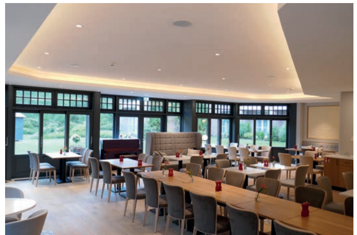
Hotel Heidegrund, Garrel, Germany